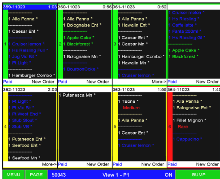
Kitchen Monitor Order View